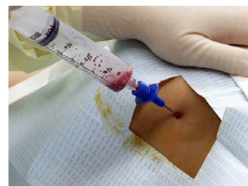
Figure 2. Aspiration of bone marrow into a syringe.